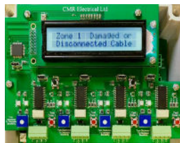
Internal Plug-in Zone Terminal connections

Unlike other water detection units on the market, the range from CMR electrical uses a bi-directional (AC) signal within the sensors. Using alternating current stops electrolyses which causes the sensors to disintegrate leaving the system unable to detect water. The use of alternating current also allows the sensors to be continually monitored even when submersed in water. This allows the system to self reset after water has been removed from the sensor and no further action to reinstate or reset the system is required. Battery backup for up to six hours can be provided, however if requested, longer backup times can be provided.